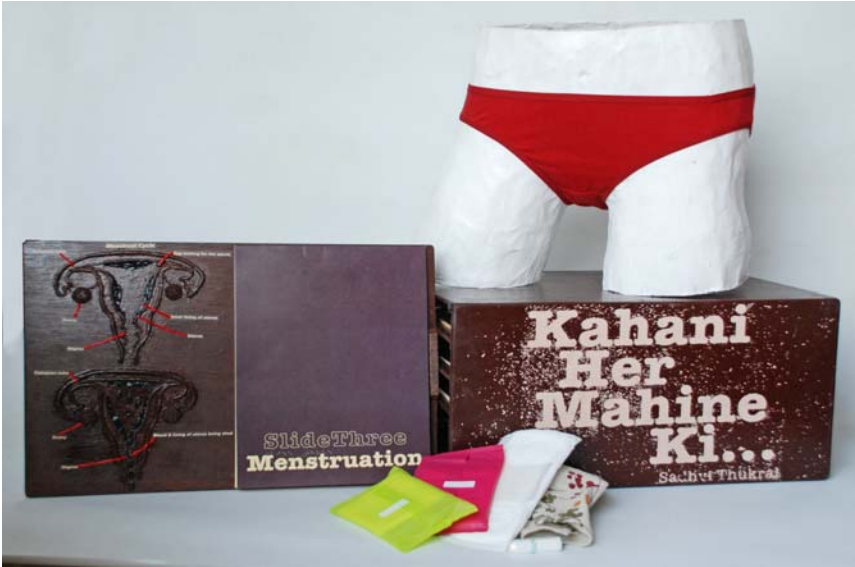
Box with Information Slates