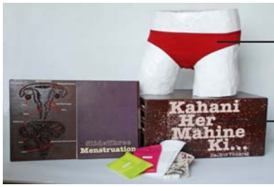
Life Size demonstration model