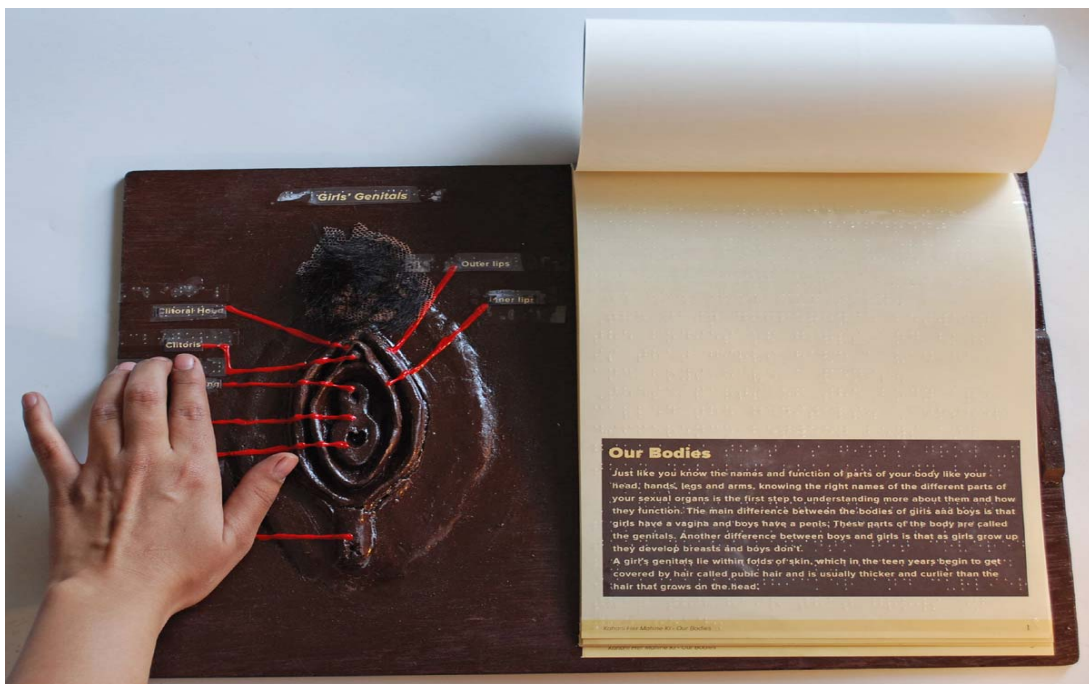
Illustrations with accompanying text for the sighted and braille for the visually impaired. The female body, detail of the uterus and external reproductive organs.